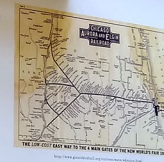
THE LOW COST GARY WAY TO THE A NEW ORDER OF THE NEW WORLD THE GARY