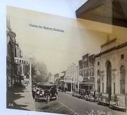
Center for History Archives