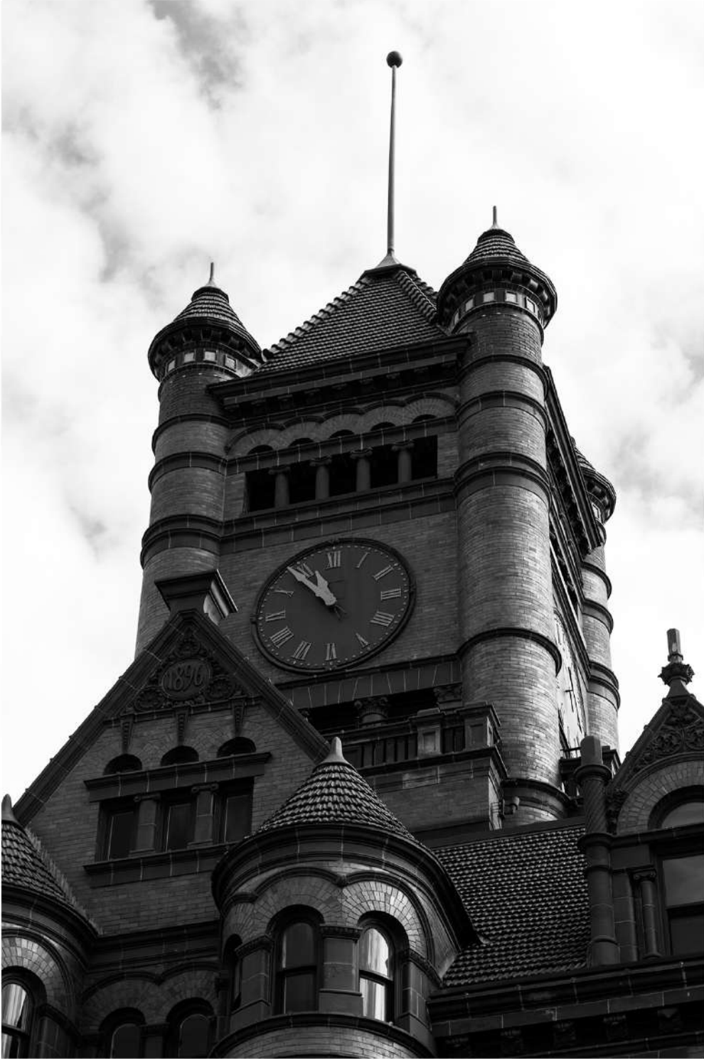
Courthouse Commons, Former DuPage County Courthouse, Wheaton, IL, 1896, west façade and bell tower 2017 Pigment Print Print size: 8 x 12 inches Frame size: 12 x 16 inches