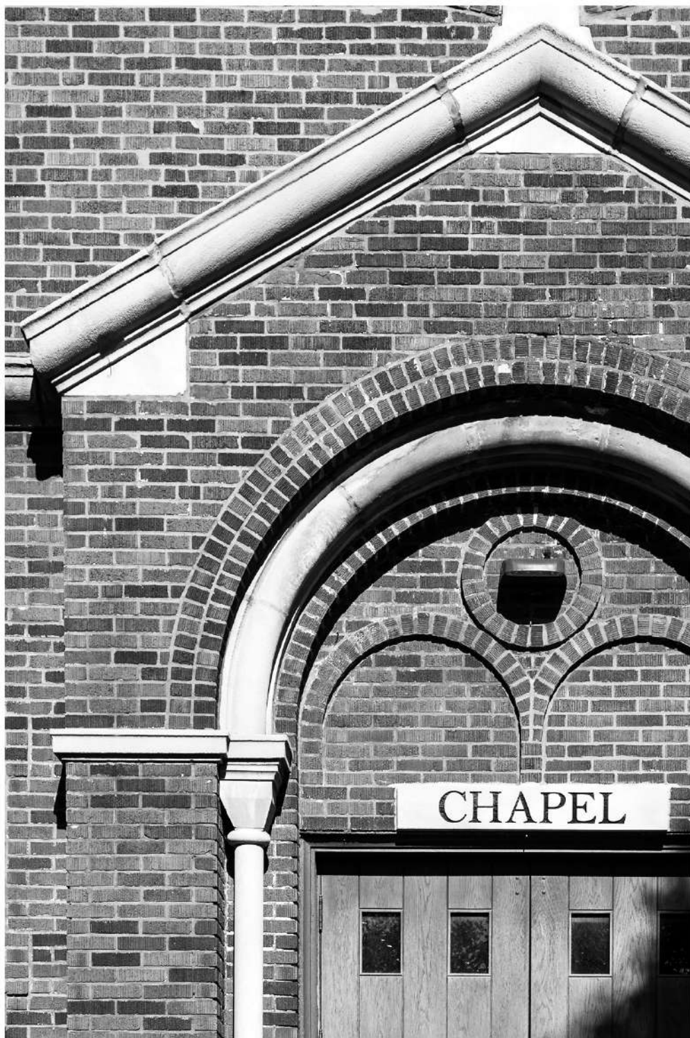
St. Isidore Church, 1920, Bloomington, IL, south entry, 1920 2022

Pigment Print Print size: 8 x 12 inches Frame size: 12 x 16 inches