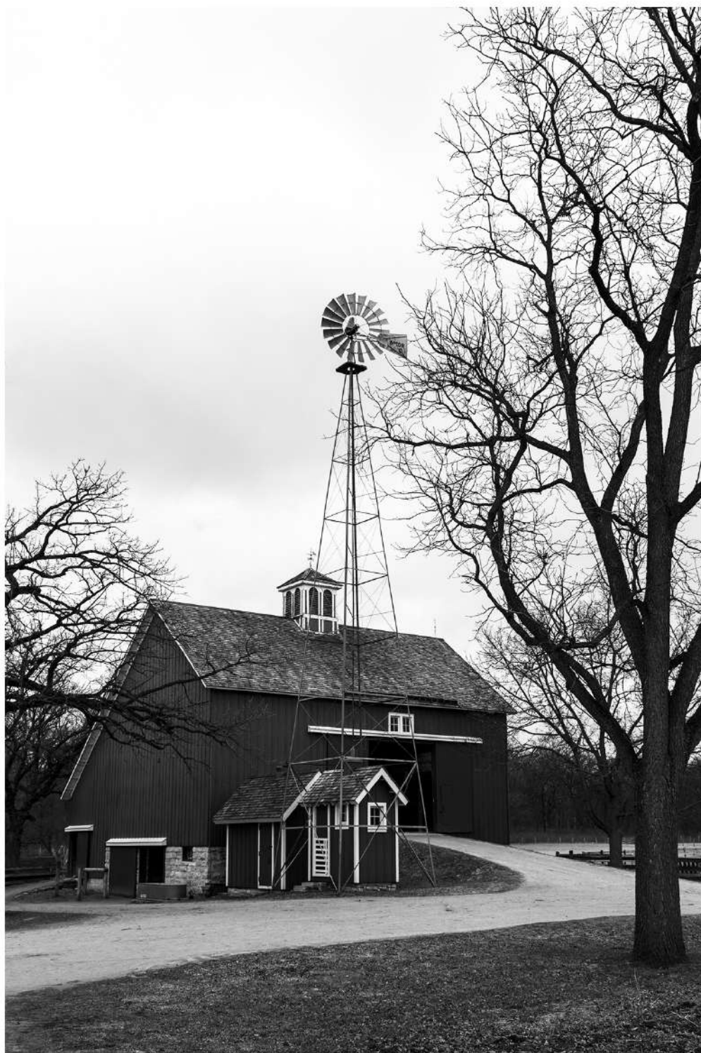
Kline Creek Farm, West Chicago, IL, c.1890 2017 Pigment Print Print size: 8 x 12 inches Frame size: 12 x 16 inches