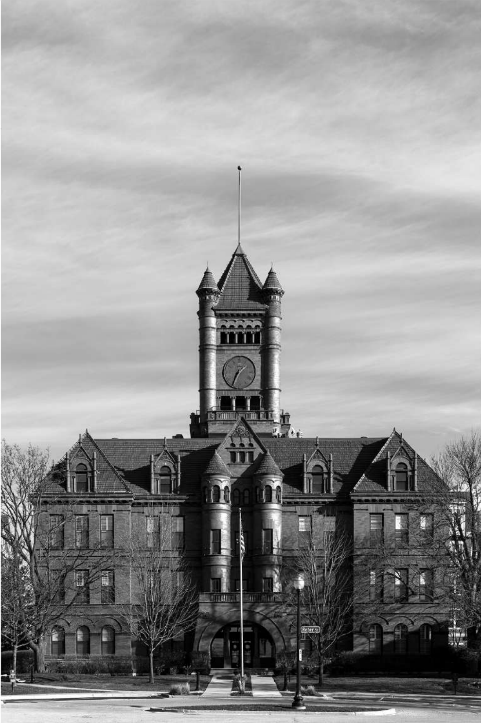
Courthouse Commons, Former DuPage County Courthouse, Wheaton, IL, 1896