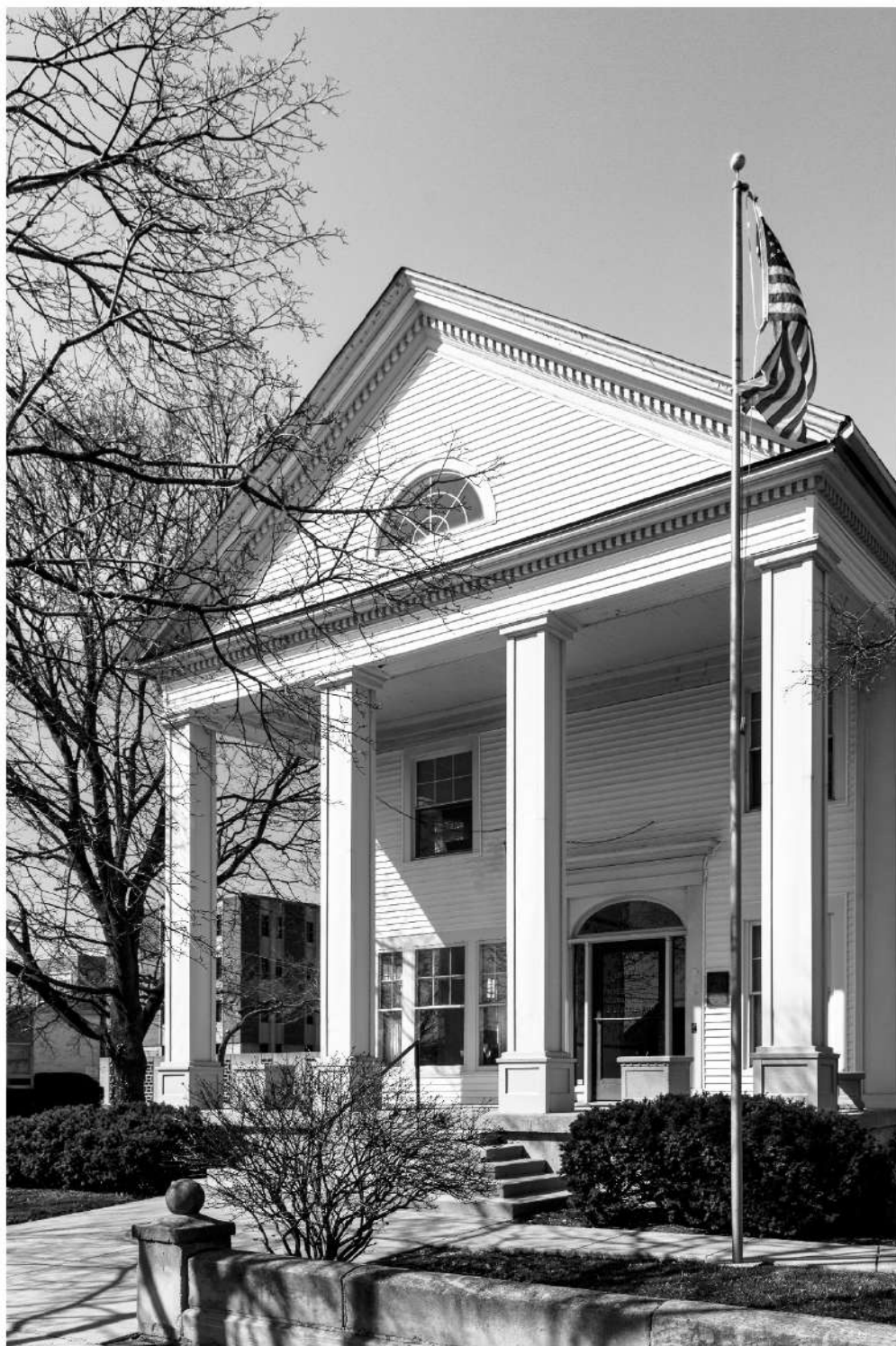
Marcellus Jones House, Wheaton, Il, 1863