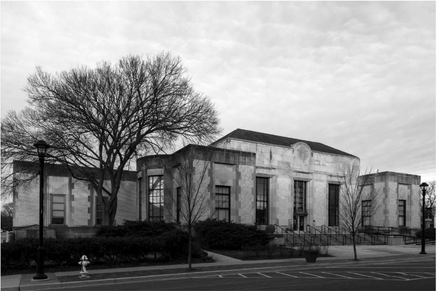
Wheaton Post Office, 1933 2024 Pigment Print Print size: 8 x 12 inches Frame size: 12 x 16 inches