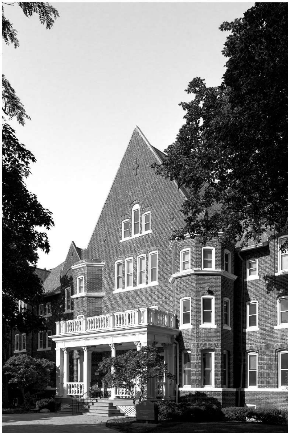
Williston Hall, Wheaton College, 1894-1896 2021 Pigment Print Print size: 8 x 12 inches Frame size: 12 x 16 inches