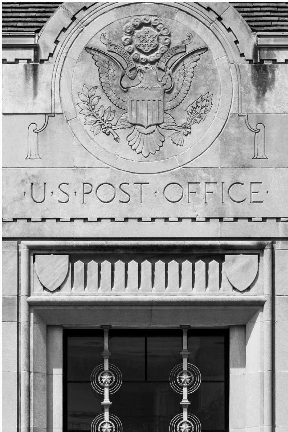
Wheaton Post Office, 1933, entry façade 2022