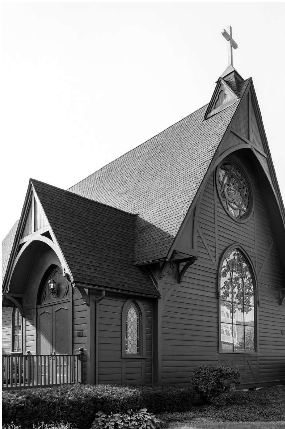
Trinity Episcopal Chapel, Wheaton, IL, 1882, view from south east