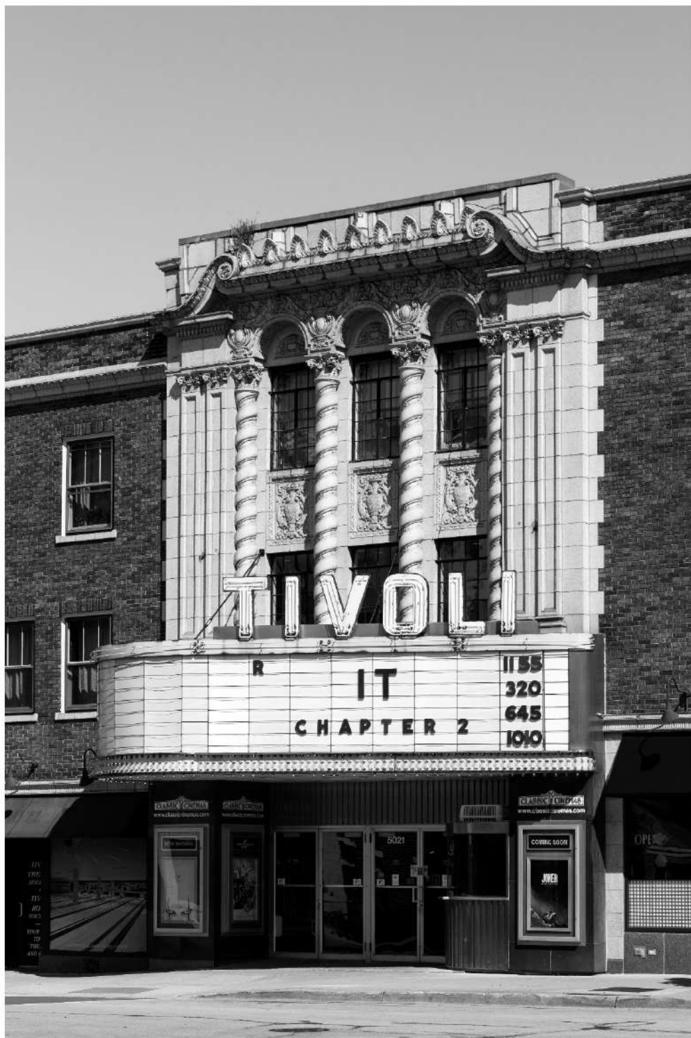
Tivoli Theater, Downers Grove, IL, 1928 2019 Pigment Print Print size: 8 x 12 inches Frame size: 12 x 16 inches