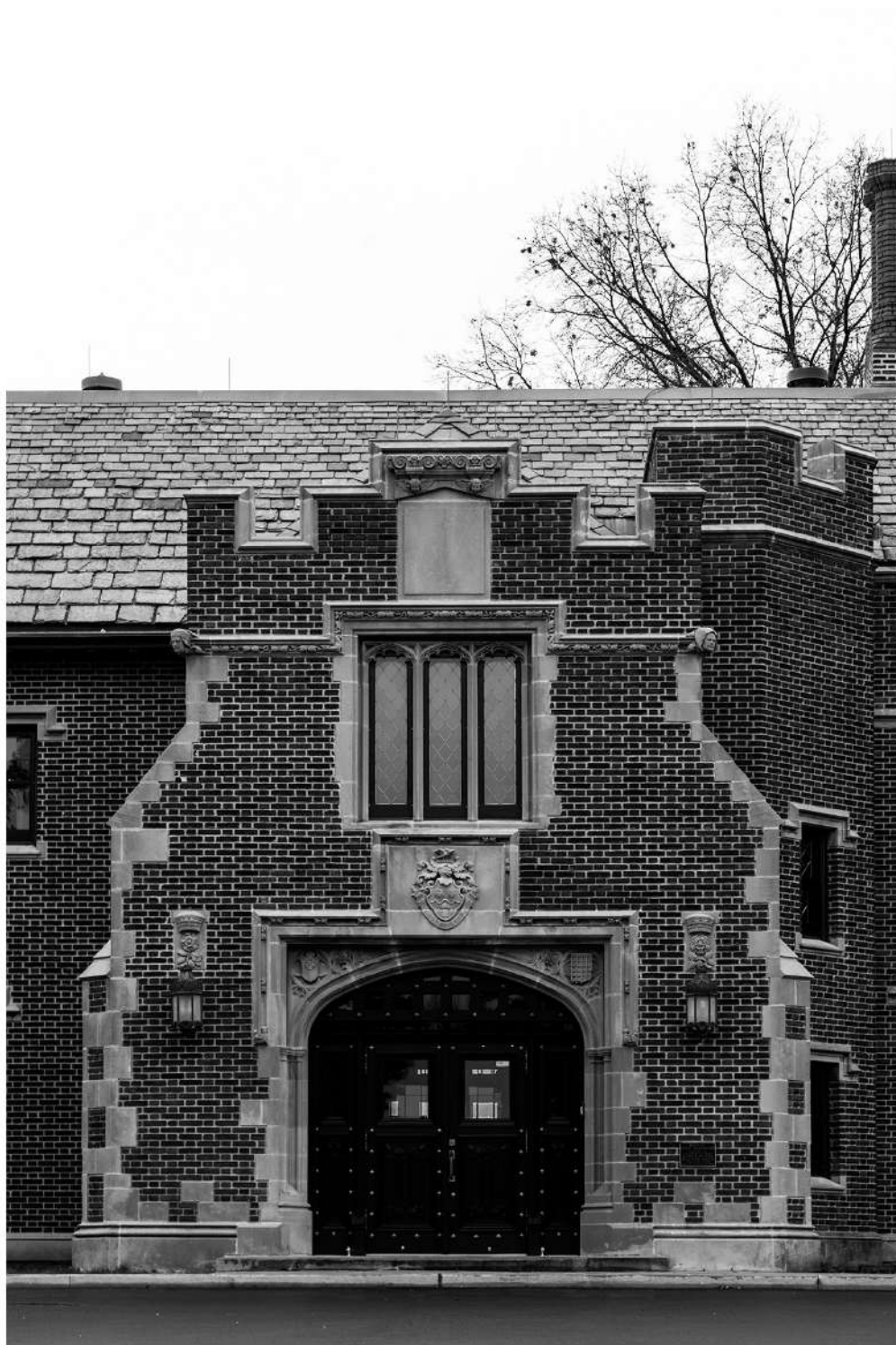
Mayslake Hall, Oakbrook, IL, 1919, main entrance 2023