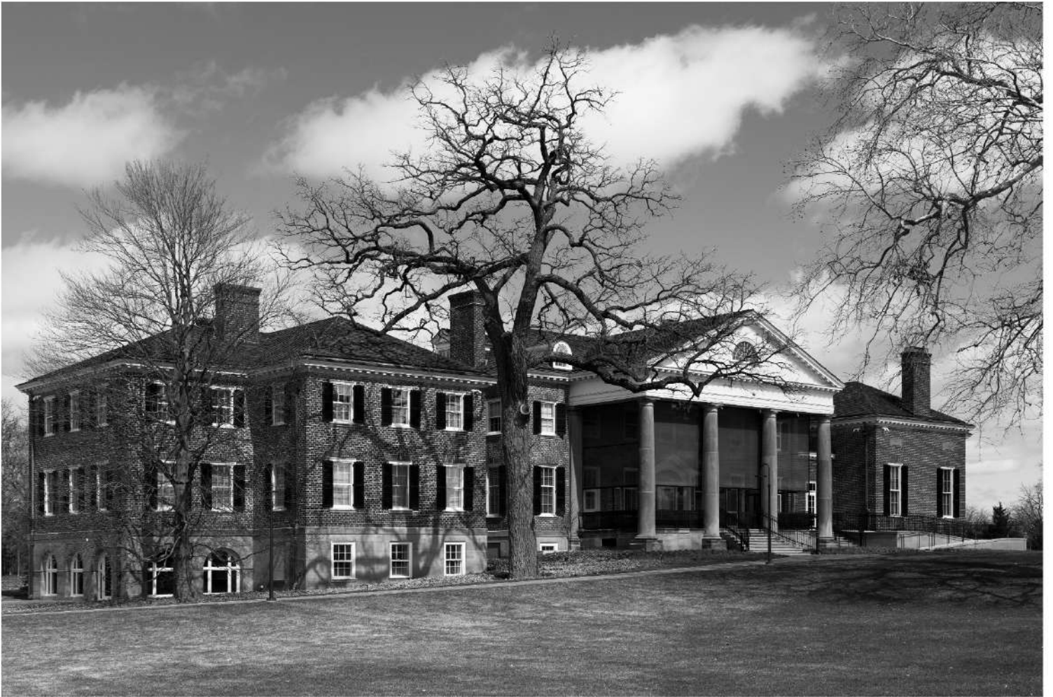
Robert R. McCormick House, Wheaton, IL, 1896, rear façade