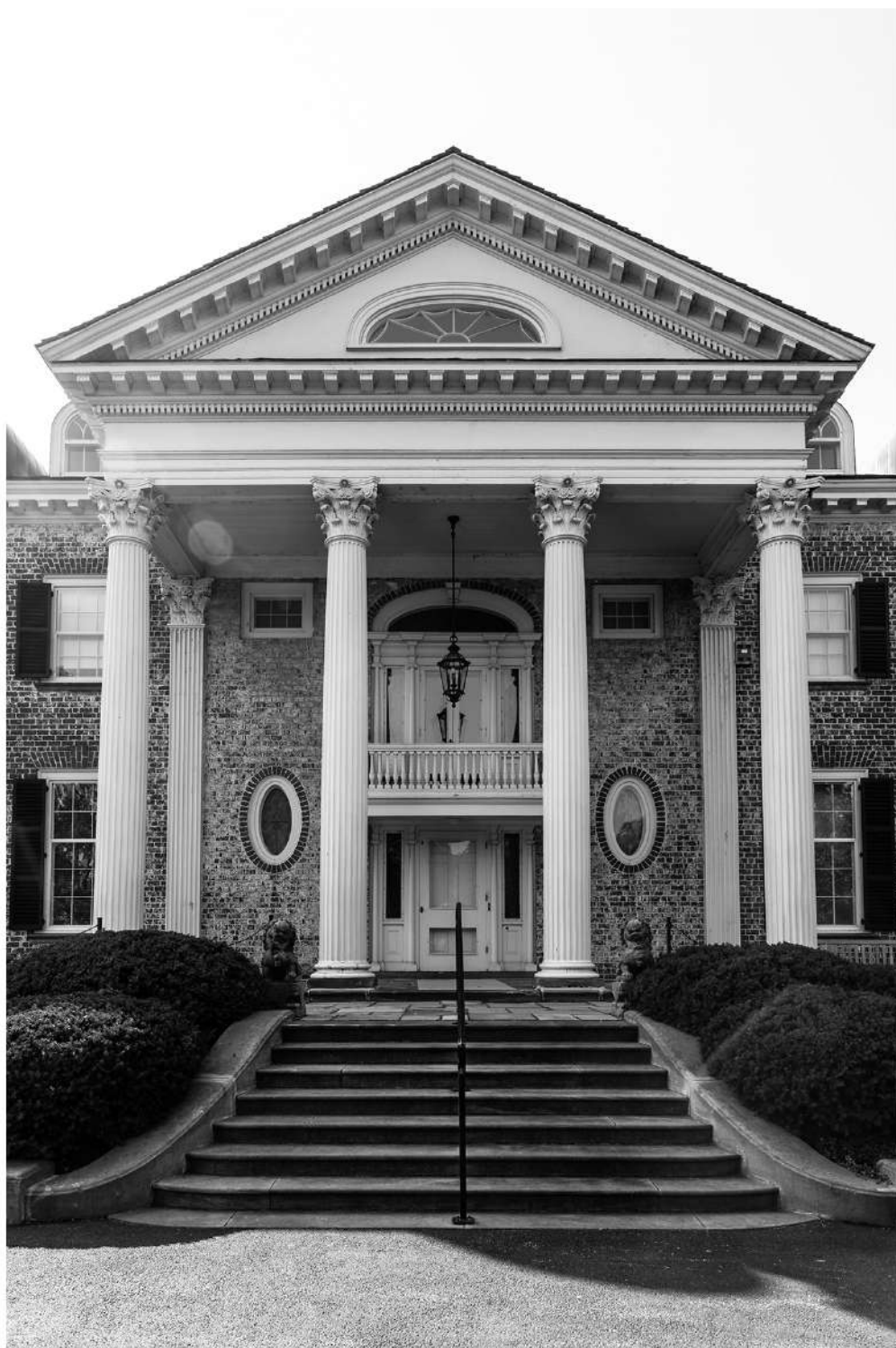
Robert R. McCormick House, Wheaton, IL, 1896, main entry 2020

Pigment Print Dimensions: 8 x 12 inches Frame size: 12 x 16 inches