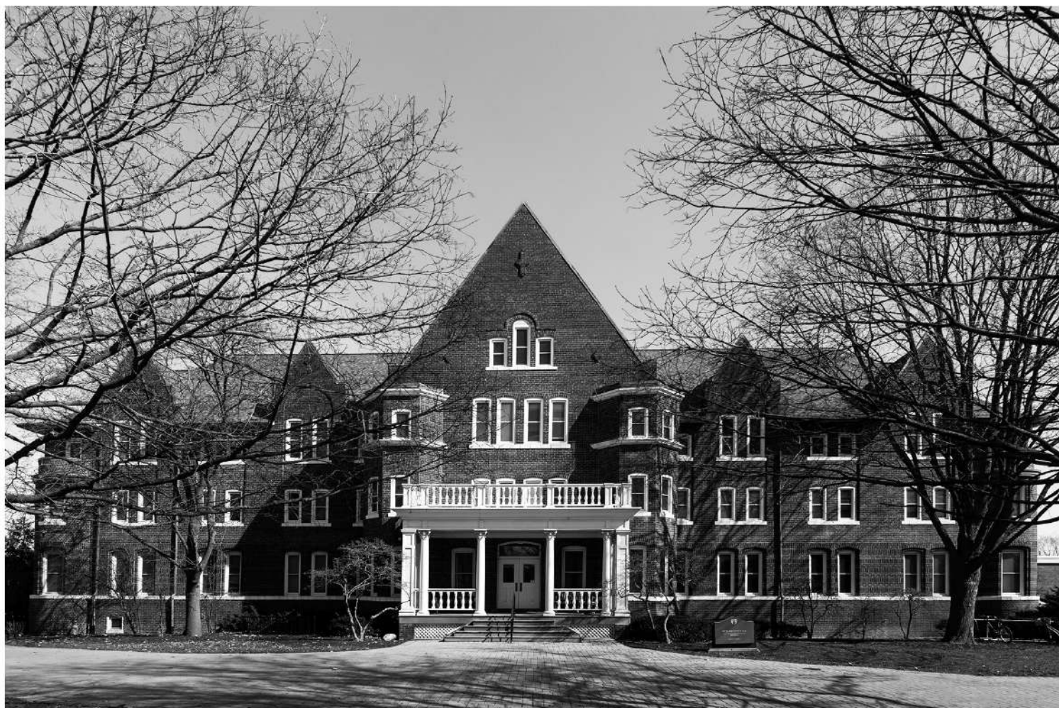
Williston Hall, Wheaton College, 1894-1896 2024 Pigment Print Print size: 8 x 12 inches Frame size: 12 x 16 inches