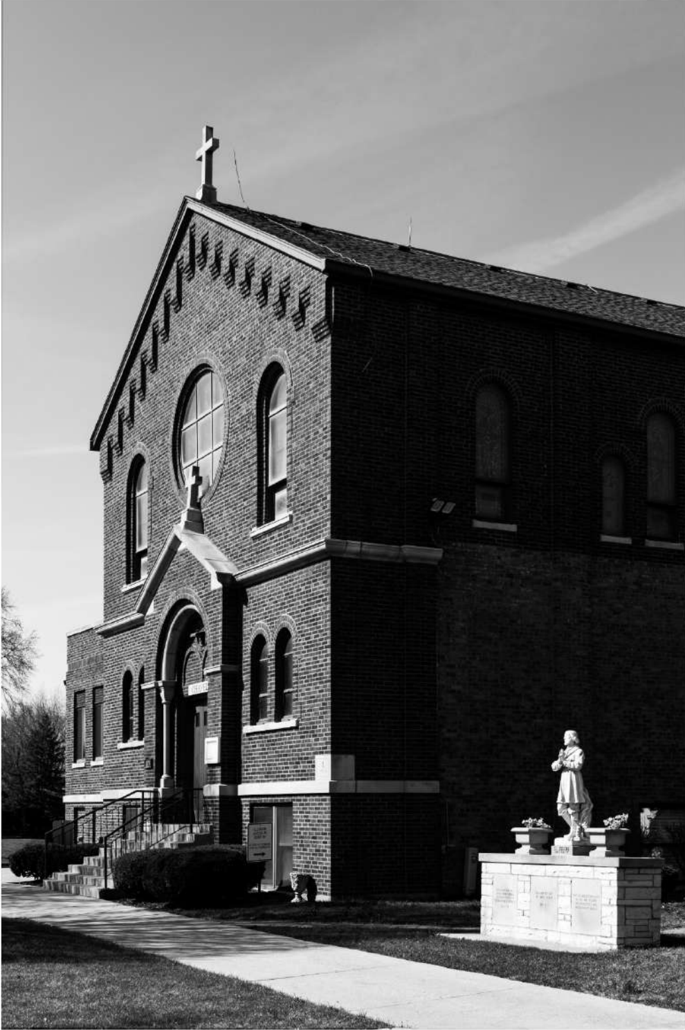
St. Isidore Church, Bloomingdale, IL, 1920, south façade 2024 Pigment Print Print size: 8 x 12 inches Frame size: 12 x 16 inches