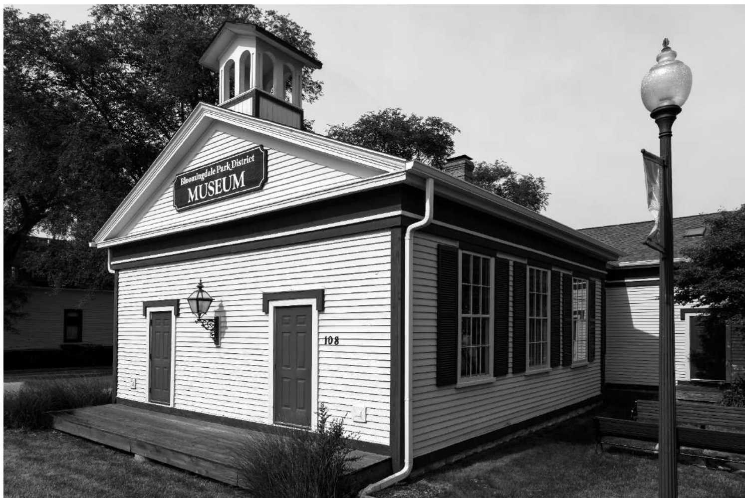
Bloomingdale Park District Museum, former Bloomingdale First Baptist Church of Christ, Bloomingdale, IL, 1849