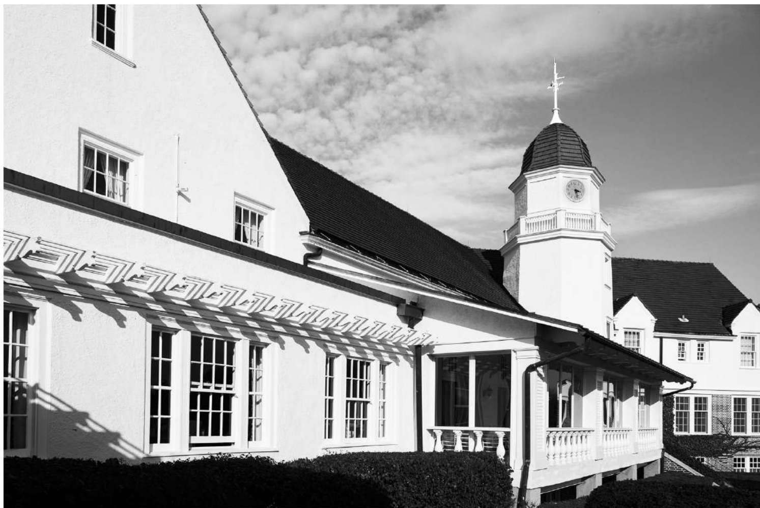
Chicago Golf Club, Wheaton, IL, 1913, clubhouse